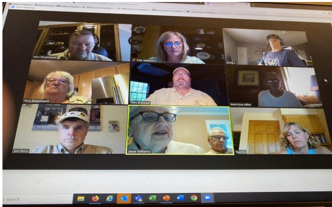
Photo: July 2020 DPHS Board of Directors Zoom Meeting