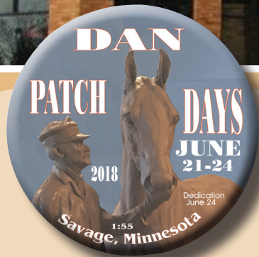
2018 Dan Patch Days Button