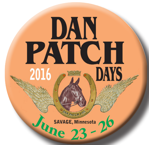
2016 Dan Patch Days Button

The image on the collector button this year comes from the logo that was used for the Minneapolis, St. Paul, Rochester and Dubuque Electric Traction Company or the Dan Patch Electric Line. It was used on things like letterheads, brochures and stock certificates.