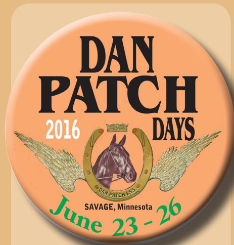
2016 Dan Patch Days Button