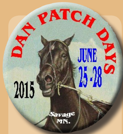
2015 Dan Patch Days Button