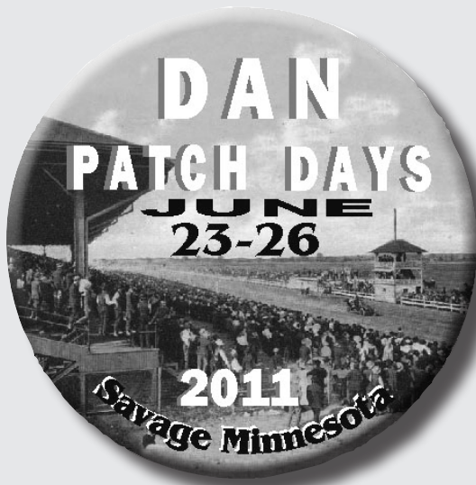
Dan Patch Days 2011 Button