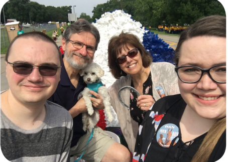
Horseshoe Hunt Winners