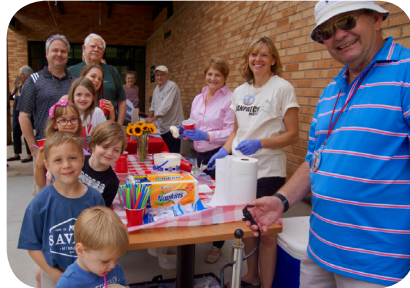
Root Beer Floats at the unveiling