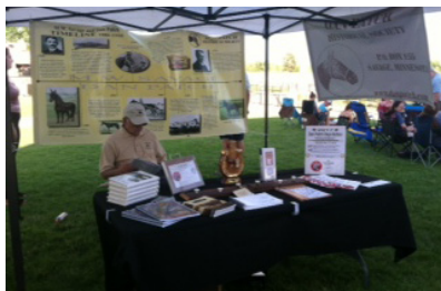
Booth at Running Aces Race Track

Running Aces Race Track annual Dan Patch Day was July 22 and we were there with a booth. They gave out Dan Patch Posters to the first 100 attendees and horse shoes to the kids.