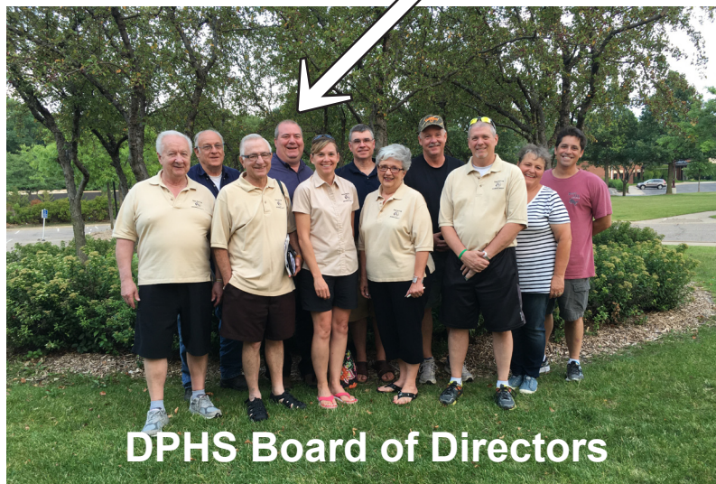
DPHS Board of Directors