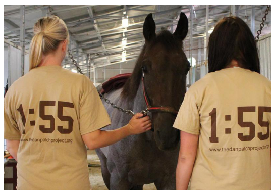
Front and Back examples of the Dan Patch Project t-shirts for sale