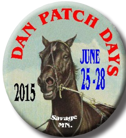
2015 Dan Patch Days Button