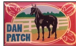
2014 MN State Fair Pin number 3, part of a 12 pin collection this year that when put together forms the shape of MN

This year, after the State Fair board approved of demolishing Heritage Square, which housed the story and memorabilia of Dan Patch, the new state of the art History and Heritage Center opened in what is now called the West End Market. In collaboration with the Minnesota Historical Society and after fundraising nearly 3 million dollars, an interactive, temperature controlled, ultra modern facility opened to much anticipation.