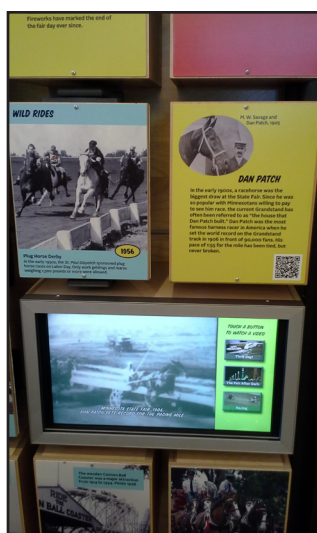
Part of the MN State Fair display of Dan Patch History