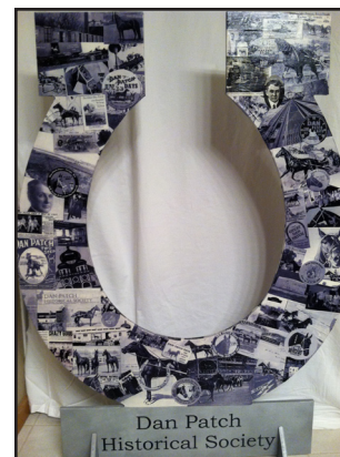
DPHS 3 ft. Wooden Horseshoe