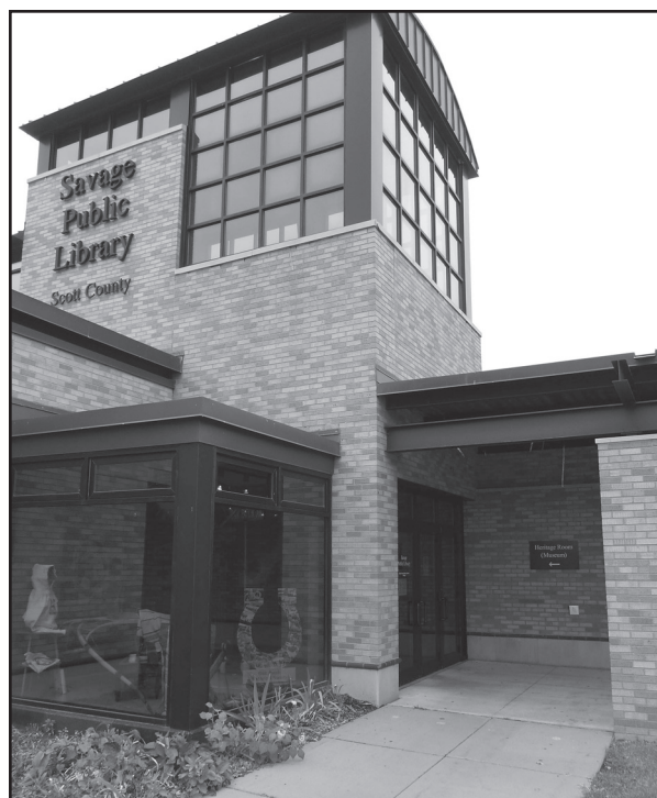
DPHS 3 ft. Wooden Horseshoe on display in the window as you enter the Savage Public Library