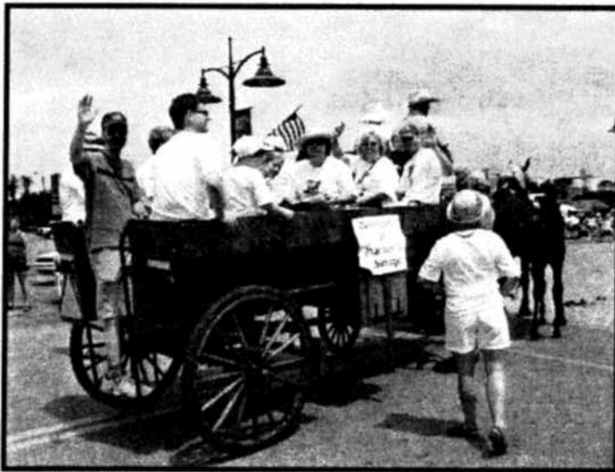
Savage Family in parade