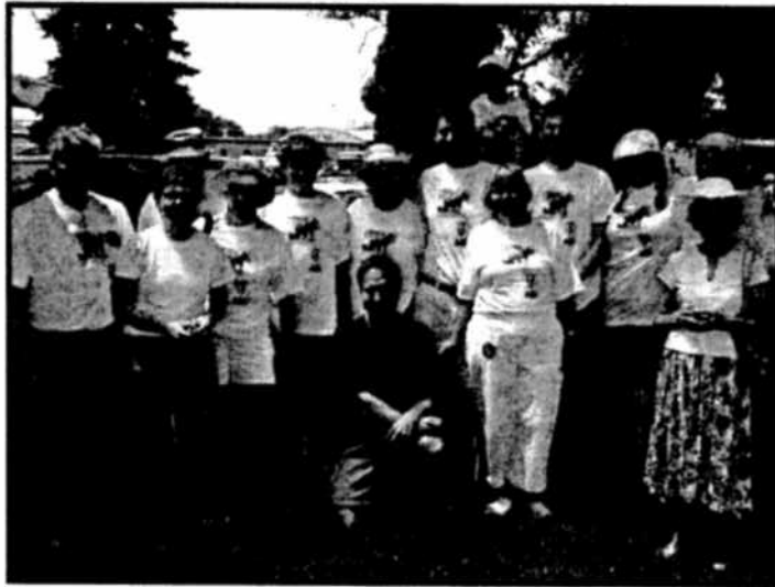
14 Savage Descendants