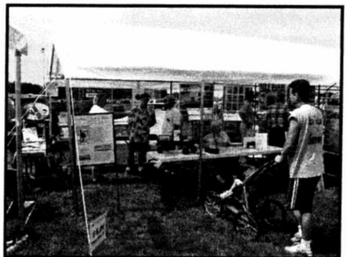
Dan Patch Historical Society booth